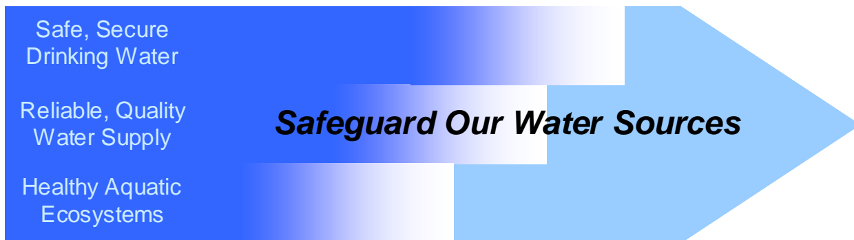
Figure 3 The Alberta Water Council's view that action toward Safeguarding our Water Sources will accelerate all three Water for Life goals.