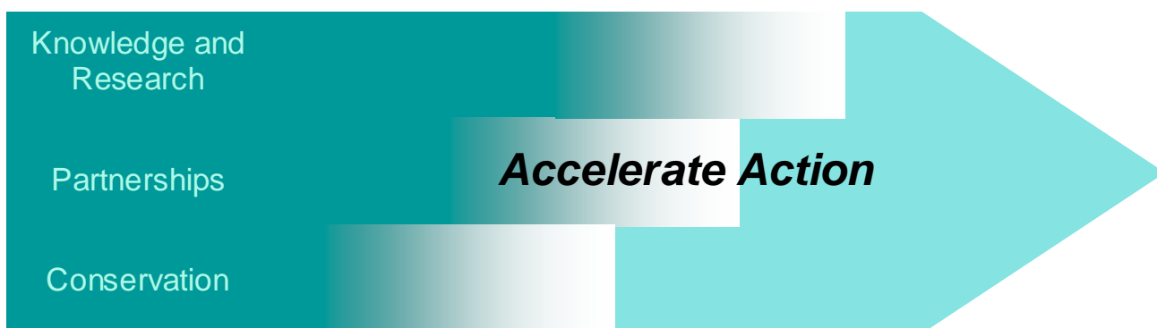
Figure 4 The Alberta Water Council's view that Accelerating our Action will affect all three Water for Life key directions.